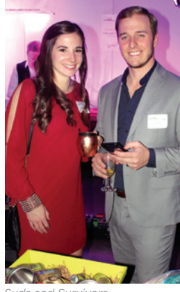
Suds and Survivors