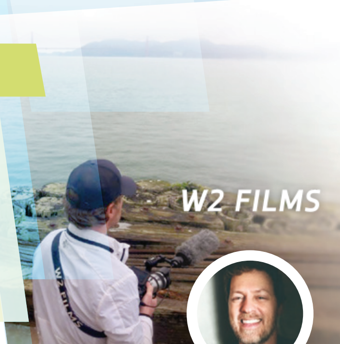
W2 Films is a Minneapolis-based video production company, producing artistic and high-production-value film material.

Currently, W2 Films and Angel Foundation are in the process of creating educational videos for the Facing Cancer Together program. The next step in a long and successful partnership to help our community, these videos will be shared online so parents with cancer can find immediate help and additional education.